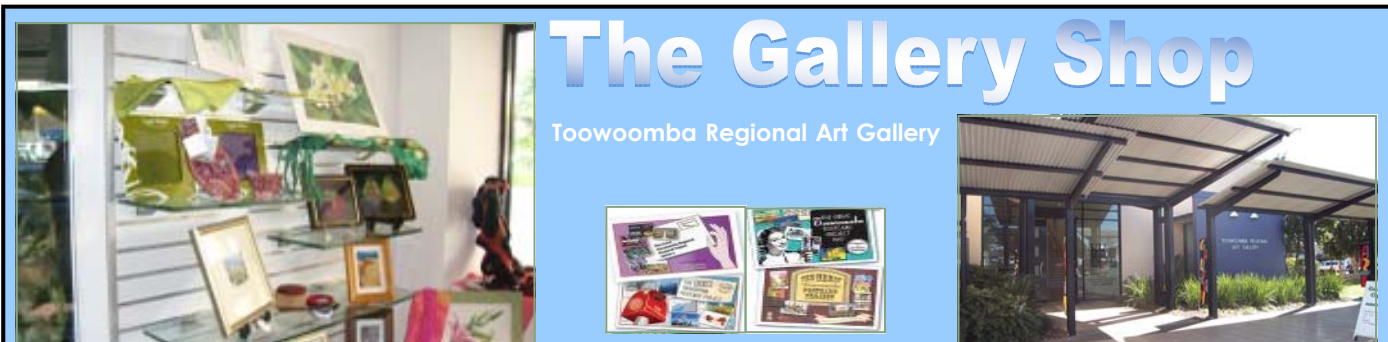
Members are encouraged to shop at The Gallery Shop – 531 Ruthven Street, Toowoomba.

The Gallery Shop carries an ever changing array of gift ideas and art works at reasonable prices. Access is from Ruthven Street or through the Toowoomba Regional Gallery. Ceramics, glass, textiles, jewellery, woodwork, prints, art books and hand made cards are displayed. Visitors can browse at their leisure and choose from the varied works of regional and interstate artists to find a special item with unique appeal.