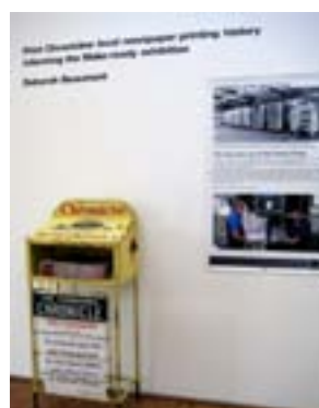
Print Chronicles Exhibition

Last year at TRAG I had two exhibitions: Make-ready (an exhibition exploring the print), and Print Chronicles (a historical survey of local newspaper printing). These were important to me as they combine my love of mark-making and contemporary printmaking with local newspaper history.